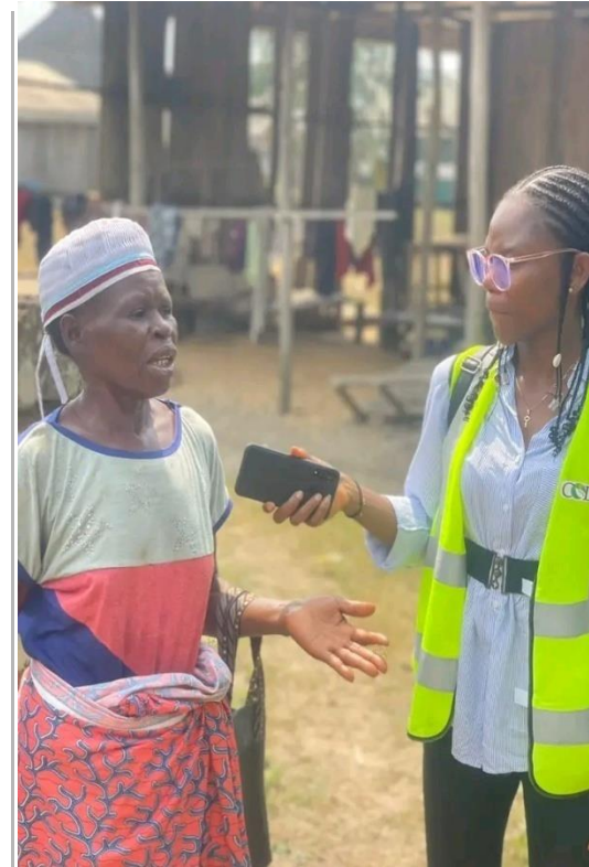
Program officer of CODAF in a chat with a woman in Odimodi

A cross section of the Odimodi women who also spoke to the CODAF media team, lamented over the effects of the oil activities. Some of the women had contracted ailments and infractions due to the high level of crude oil in their farm lands, their waters and all over their environment.