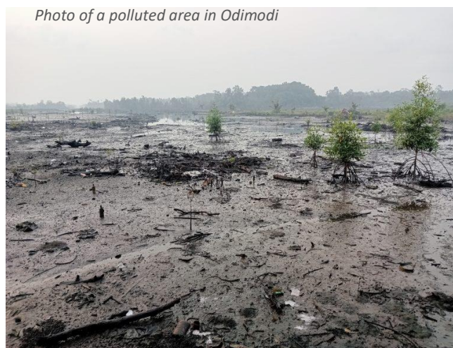
Photo of a polluted area in Odimodi

On Sunday August 21, 2022, an incident of toxic spills from Shell's facilities in Odimodi, is a testament of the incessant oil spills that occurs in the community and regrettably, it is the environment and the people that bears the brunt with little or no compensation.