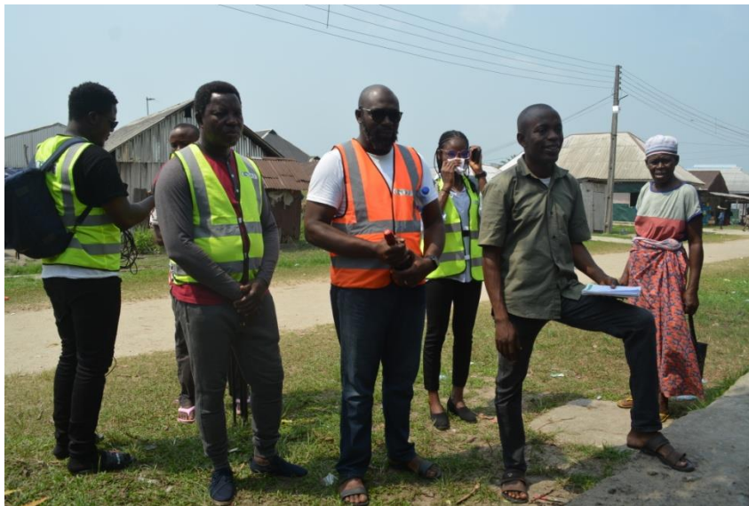
CODAF team in Odimodi

organizations and the international community, to the issues of oil spills and chemical waste disposals that have destroyed the lands and waters around the Niger Delta, and the untold hardship it has caused the people.