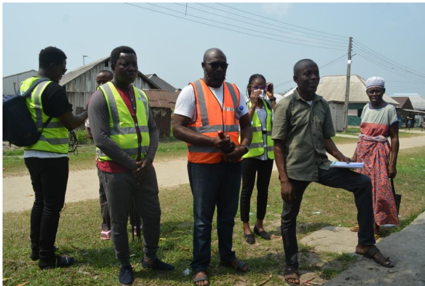
CODAF team in Odimodi

organizations and the international community, to the issues of oil spills and chemical waste disposals that have destroyed the lands and waters around the Niger Delta, and the untold hardship it has caused the people.