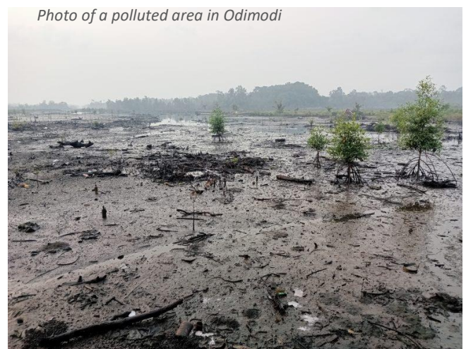
Photo of a polluted area in Odimodi

On Sunday August 21, 2022, an incident of toxic spills from Shell's facilities in Odimodi, is a testament of the incessant oil spills that occurs in the community and regrettably, it is the environment and the people that bears the brunt with little or no compensation.